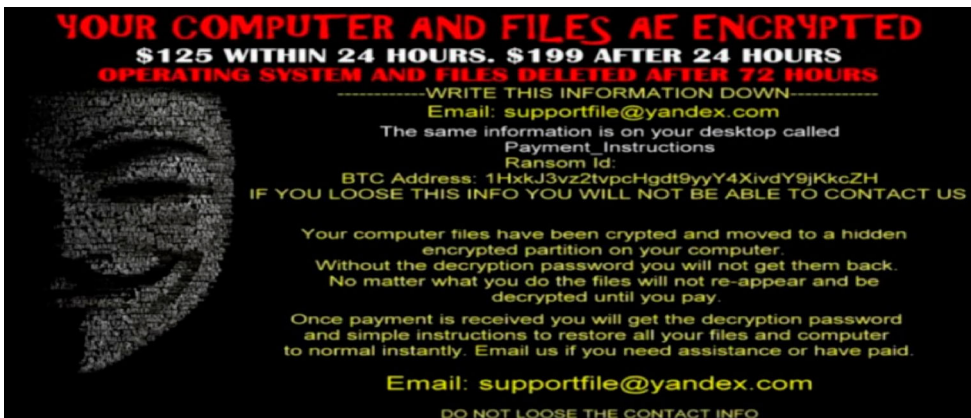
Figure A2. Ransomware simulation screen.

Simulation screen 2: Shortly afterwards, one of your operator consoles shows the following attack (Figure A2):